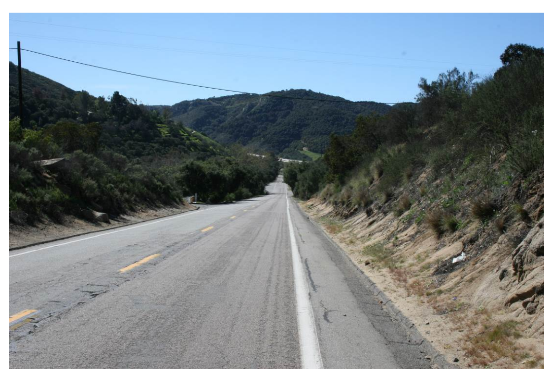
Photograph 10: Existing view looking southwest along Old Highway 395 (at approximate MP 12.1)