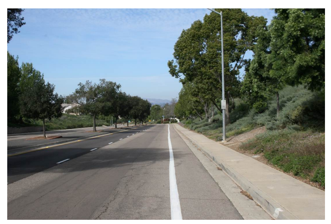
Photograph 19: Existing view facing north along Pomerado Road (at approximate MP 31).