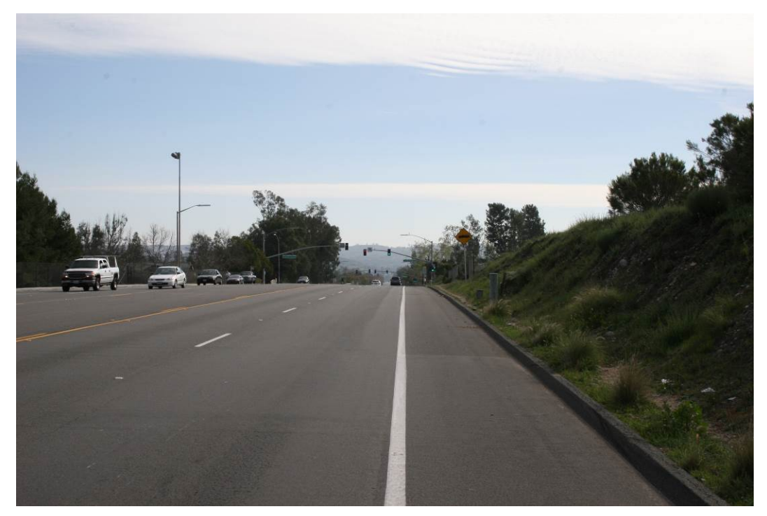
Photograph 21: Existing view from Pomerado Road, looking south (at approximate MP 36).