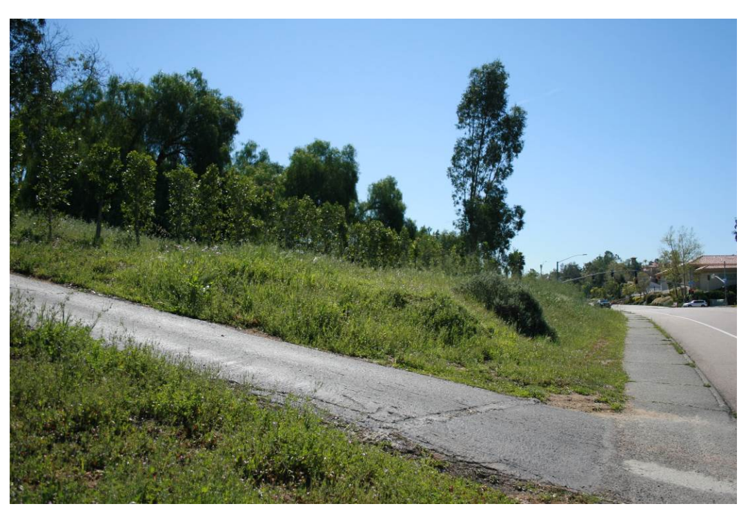
Photograph 20: Location of MLV 8, as viewed from the southeast along Pomerado Road (at approximate MP 34).