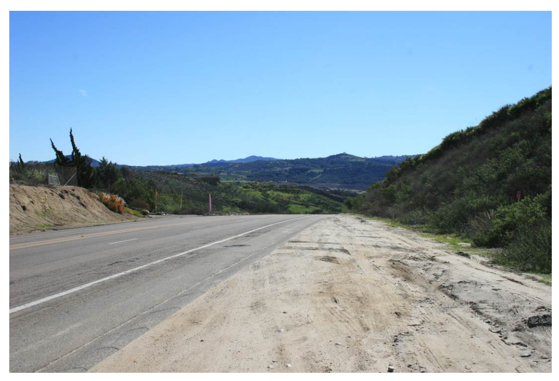
Photograph 9: Existing view looking southeast toward the location of proposed MLV 3, along Old Highway 395 (at approximate MP 10.8).