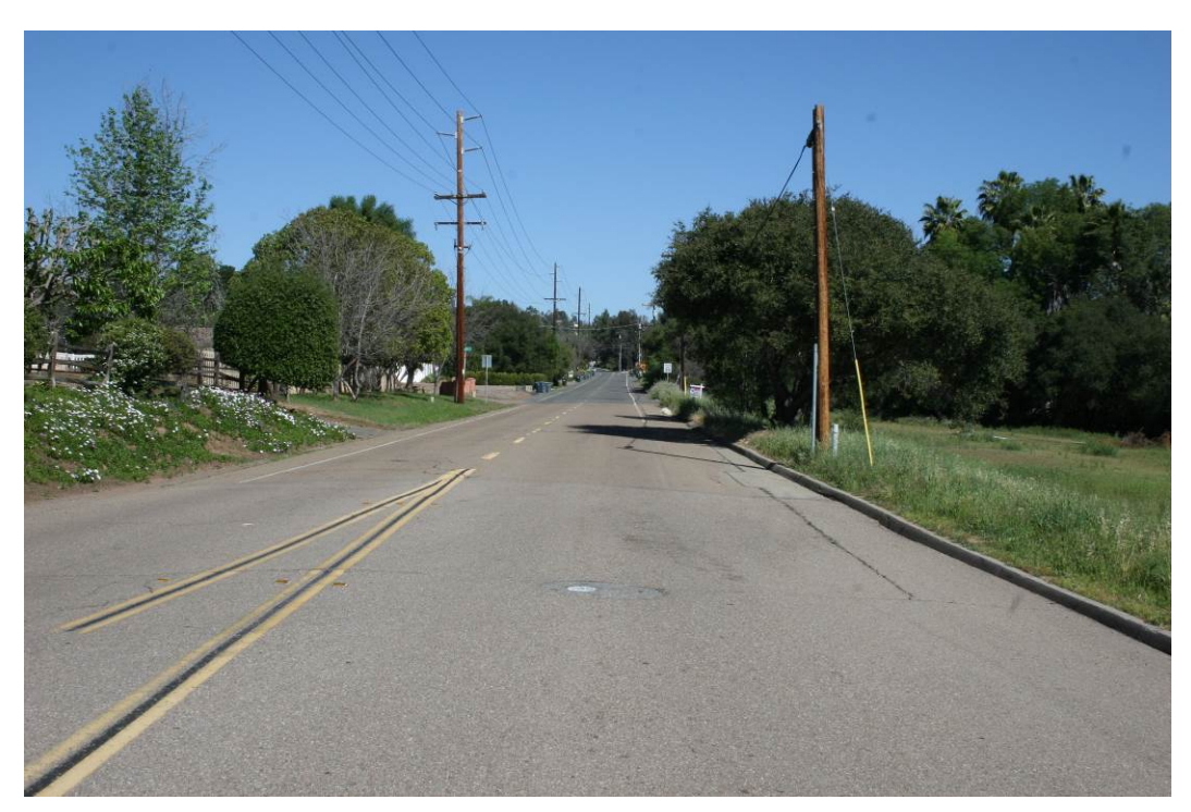
Photograph 17: Existing view looking north along Encino Drive (at approximate MP 27).