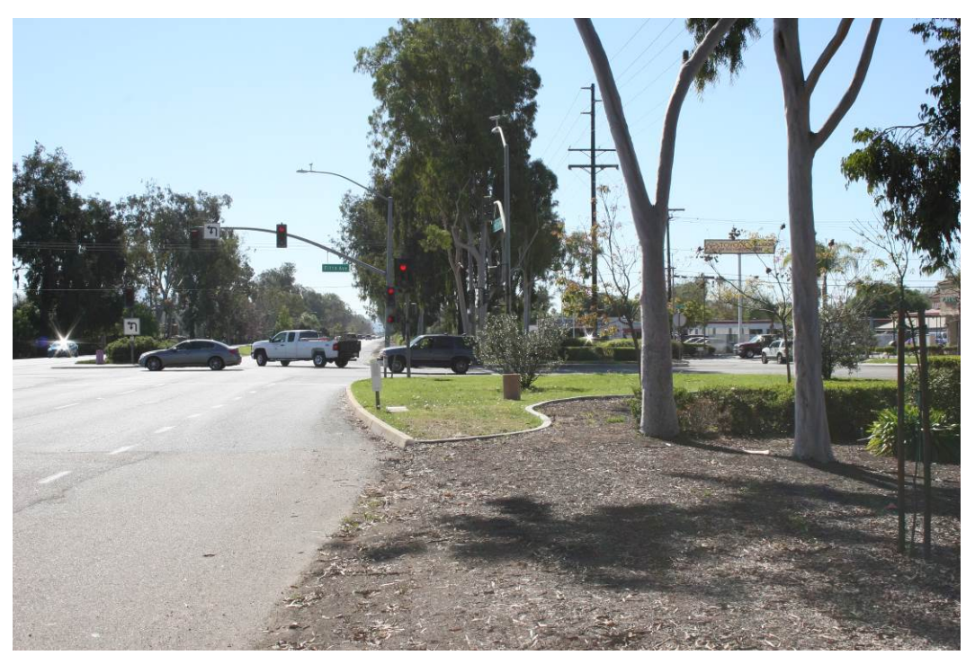
Photograph 15: Existing view looking south toward the location of MLV 6 at the intersection of South Centre City Parkway and West 5<sup>th</sup> Avenue (at approximate MP 24.6).