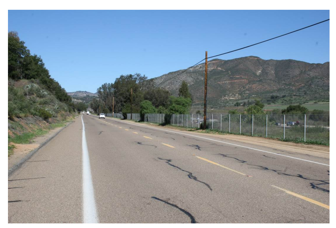
Photograph 7: Existing view looking northeast along Old Highway 395 (at approximate MP 7.1).