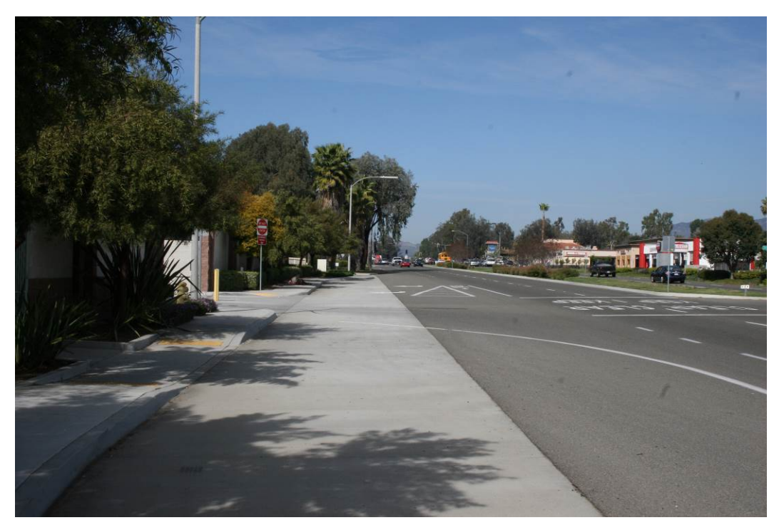
Photograph 14: Existing view looking north along North Centre City Parkway (at approximate MP 23.1).