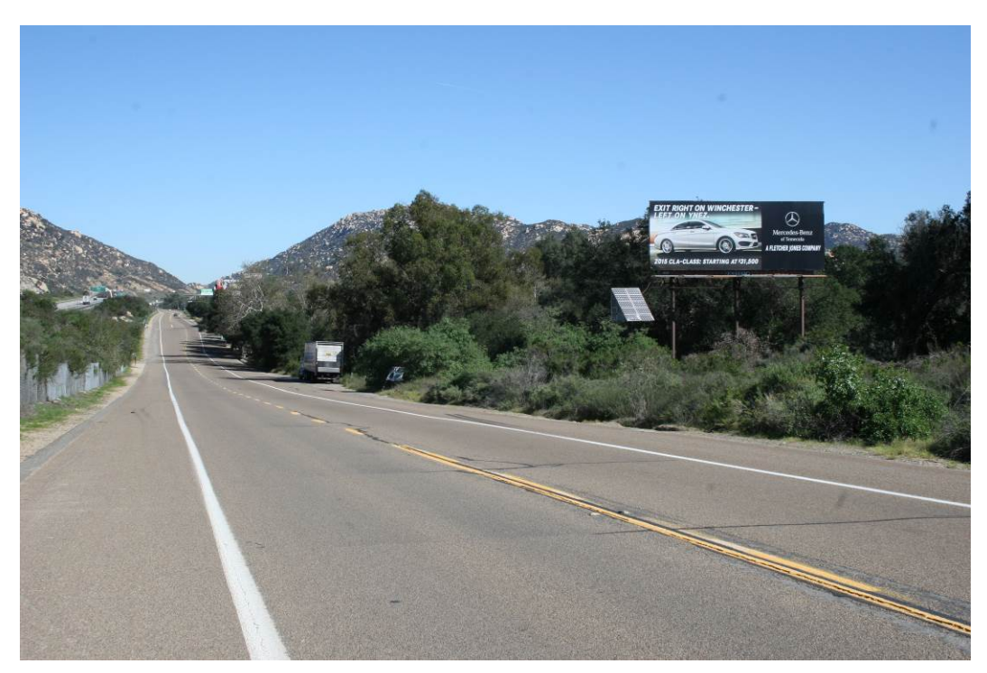
Photograph 3: Old Highway 395, looking northeast at approximate MP 2.