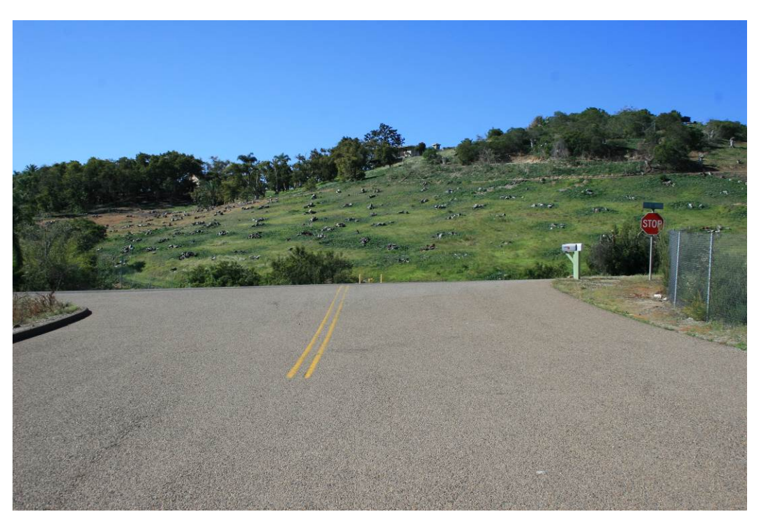
Photograph 5: View from approximate MP 3.8 facing south toward Mission Road (a San Diego County-designated scenic roadway).