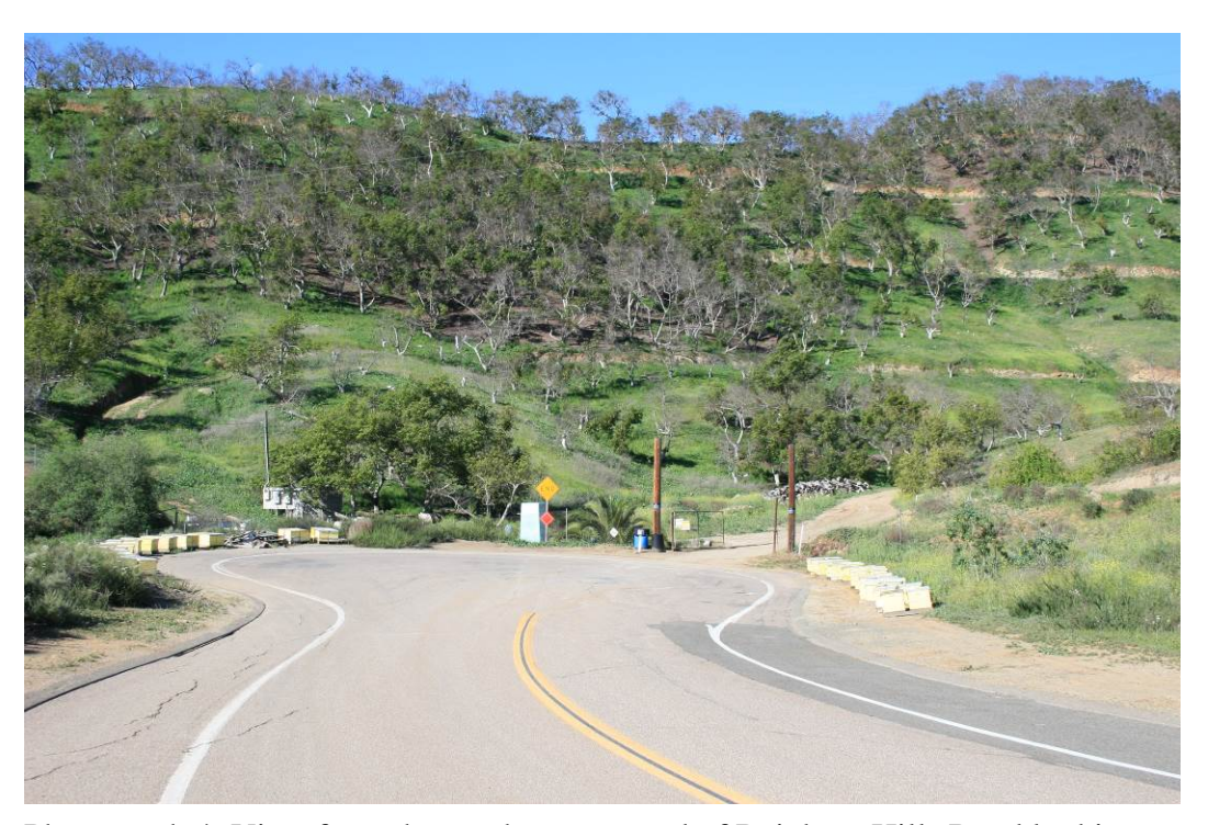
Photograph 4: View from the southwestern end of Rainbow Hills Road looking southwest, where Laydown #2 will be located and where cross-country installation of the Proposed Project will occur (at approximate MP 3.3).