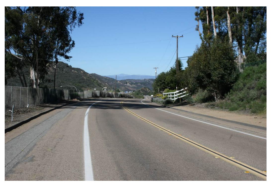
Photograph 12: Existing view looking northwest along Old Highway 395 (at approximate MP 18).