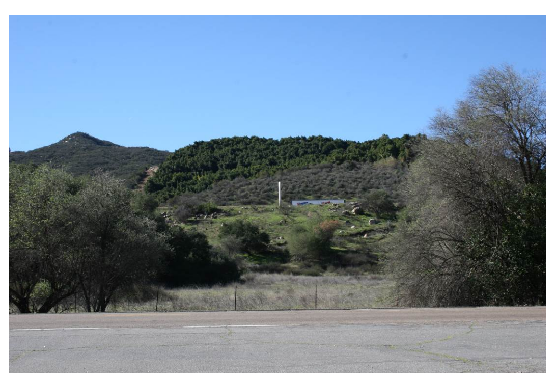
Photograph 11: Existing view looking west toward the location of MLV 4, along Old Highway 395 (at approximate MP 15.4).