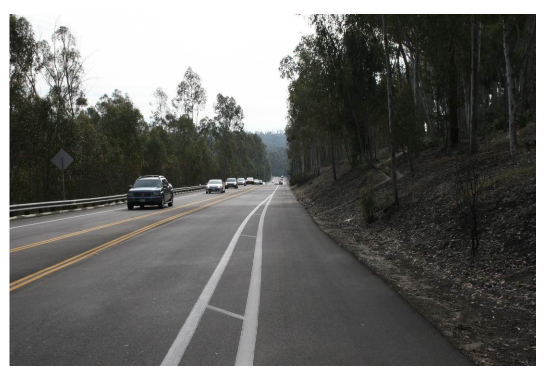
Photograph 23: Existing view looking southwest along Pomerado Road (at approximate MP 41).