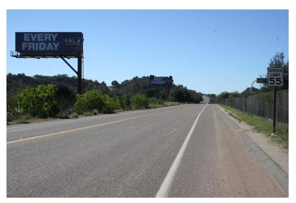
Photograph 2: The location of proposed Mainline Valve (MLV) 1, looking south along Old Highway 395 (at approximate Milepost [MP] 1.5).