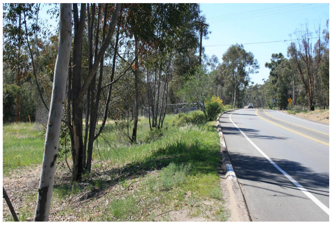
Photograph 24: Location of MLV 10, facing west from Pomerado Road (at approximate MP 42.8).