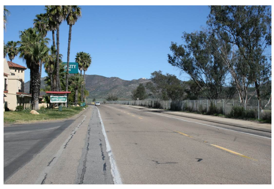
Photograph 8: Existing view looking north toward an existing hotel along Old Highway 395 (at approximate MP 8).