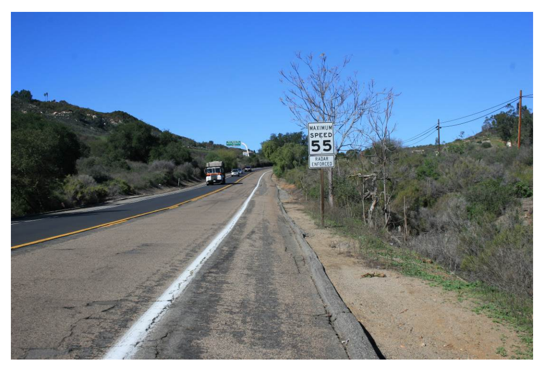
Photograph 13: Existing view looking north-northwest toward the location of MLV 5 along North Centre City Parkway (at approximate MP 20).