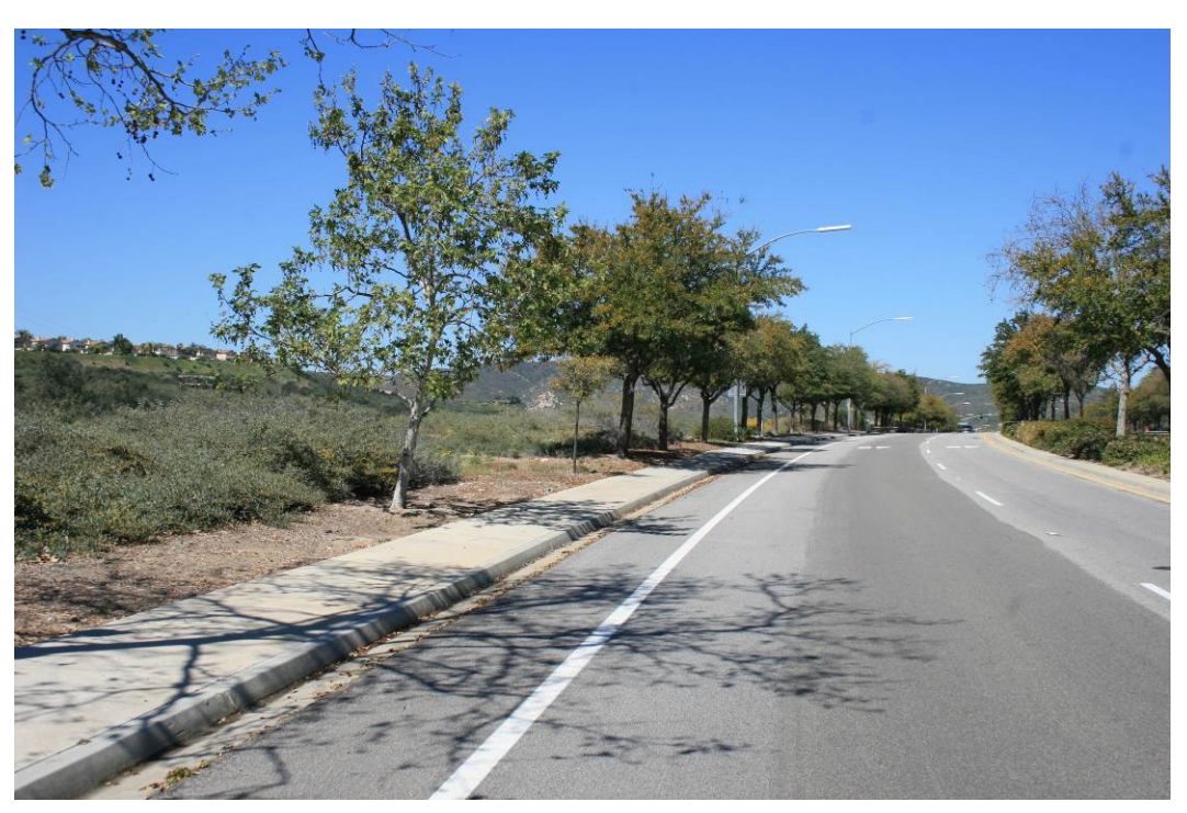
Photograph 22: Location of MLV 9, as viewed from the south along Pomerado Road (at approximate MP 38.8).