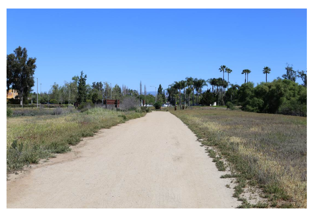
Photograph 18: Location of the Line 1600 Cross-Tie, as viewed from the south along the Mule Hill Trail (at approximate MP 29.3). This photograph shows the existing conditions in the vicinity of the Line 1600 Cross-Tie and was used for the visual simulation in Figure 4.1-1: Visual Simulation – Line 1600 Cross-Tie.