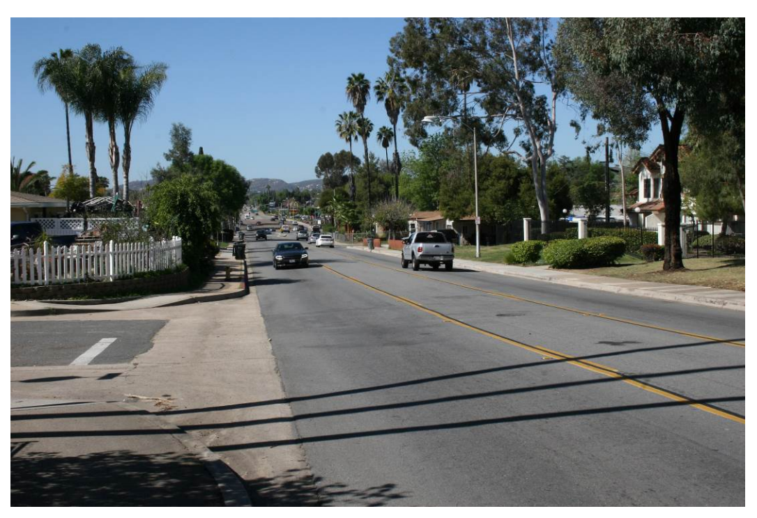
Photograph 16: Existing view looking southwest along East Felicita Avenue (at approximate MP 26).