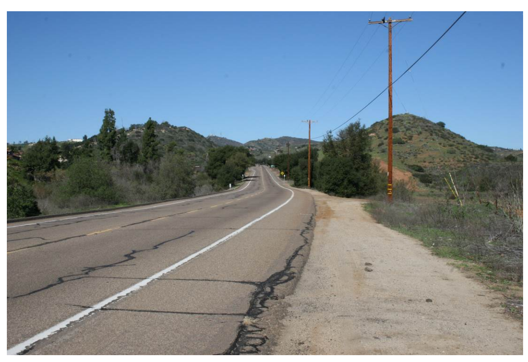
Photograph 6: The location of proposed MLV 2, looking north-northwest along Old Highway 395 (at approximate MP 6.2).